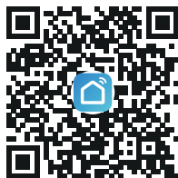
Smart Life App